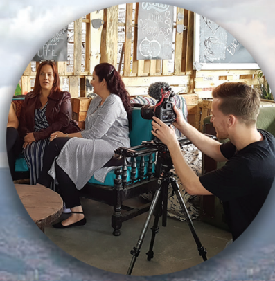
Management and General