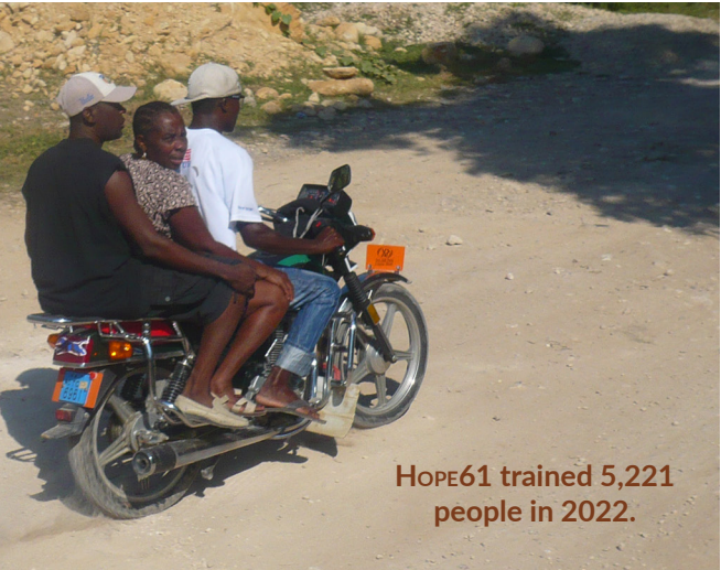
HOPE61 trained 5,221 people in 2022.

HOPE61 uses ENGAGE trainings to mobilize churches around the world to prevent human trafficking in their communities by addressing vulnerabilities that can lead to involvement in trafficking as victims, buyers, and/or traffickers. A core part of the training is the emphasis on sharing the message of the Gospel with those who are vulnerable.